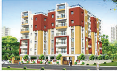
Sai Syamal Enclave - Gachibowli, Hyd.