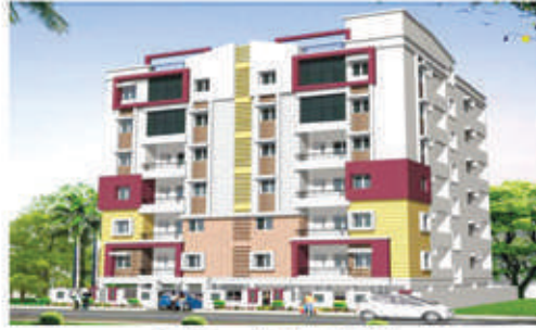
Sai Kuteer -Manikonda, Hyd.