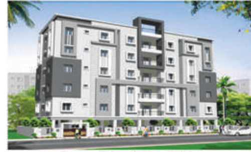
Ayyappa Kuteer -Manikonda, Hyd.